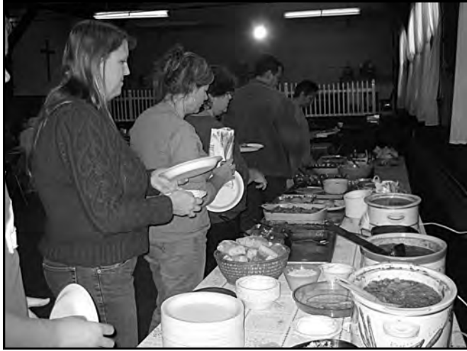
Pot Luck Dinner