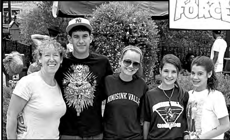
Youth Group at Dorney Park